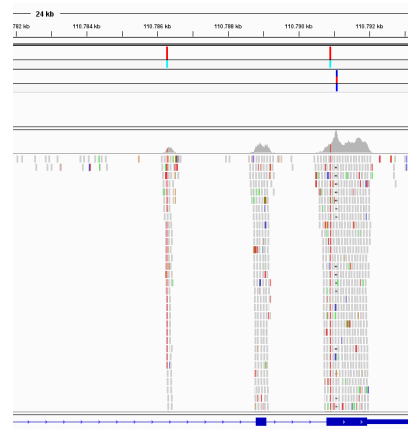
Figure 3: The data allows a detailed data inspection with a genome browser. Besides the refined data, raw and intermediate data in standard file formats are provided. This allows an overarching inspection and in-depth verification of the results by publicly available tools.